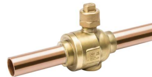
Transcritical CO2 Ball Valve

Price List Reference: 064 – Mueller ACR Valves & Parts