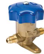
Packless Diaphragm Valve