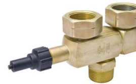
Dual Pressure Relief Valve