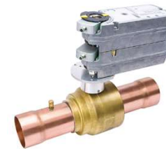
Actuated Ball Valve