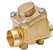
4 Bolt Check Valve