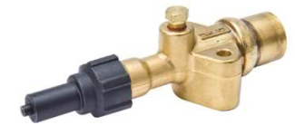
Compressor Valve, Straight Port Copper