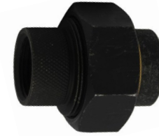
FIP x FIP