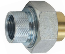
FIP GALV x FIP Brass