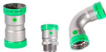
MECHPRESS | MECHANICAL & FIRE PROTECTION