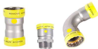
MECHPRESS-G | GAS & FUEL OIL