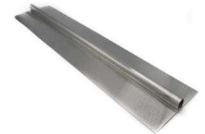
Heat Transfer Plate