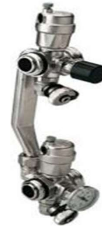
Differential Pressure Bypass Assembly