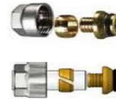
Compression x Manifold Adapters

Choose from two header sizes (1" and 1 1/4" high capacity) with configurations of 2 to 12 loops to match your design layout.