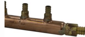
PEX Inlet – PEX Branches