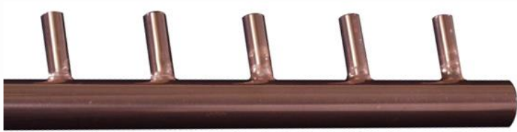
72" Copper Head