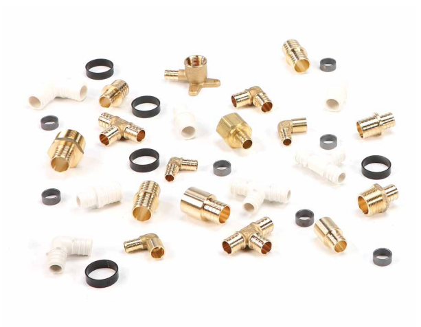
ABOVE: BRASS AND POLY-ALLOY INSERT FITTINGS SHOWN WITH COPPER CRIMP RINGS

CANPEX UV Plus production began in November 2010 and is in stock at our warehouses. CANPEX UV Plus comes with a system-wide 25-year limited warranty.